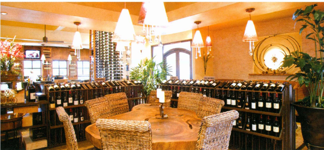
Dolce Pane E Vino